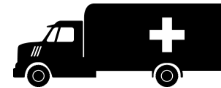
Ambulances with high electrical demands