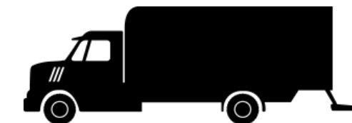
Trucks with electric lift gates