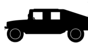
Off-roaders used to heavy vibration