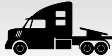
Sleeper cabs with hotel loads