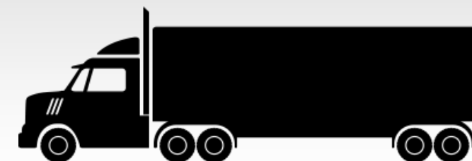
Auxiliary power units in big rigs