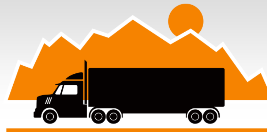
Hot weather package

Select a 31-LHD for: High-heat climates, refrigeration units or mid-size generators