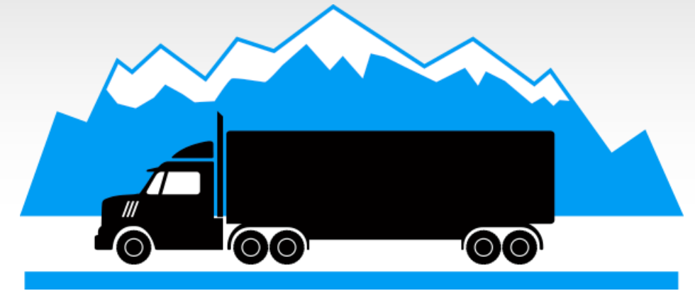
Cold weather package