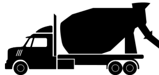
Concrete mixers working on or off-road