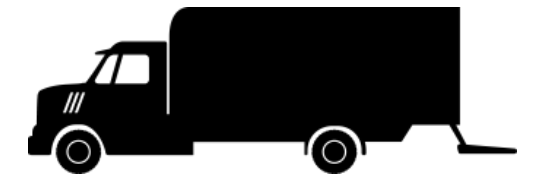
Trucks with electric lift gates