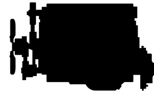
Large diesel engines