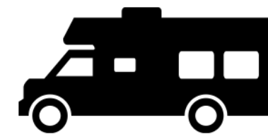
Recreational vehicles with high-power demands