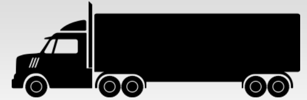
Auxiliary power units for big rigs