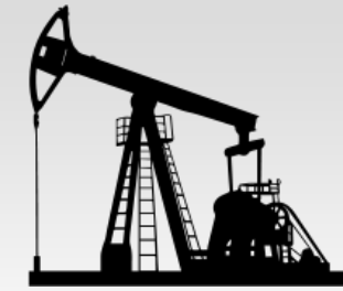
Oil field equipment with high heat and vibration