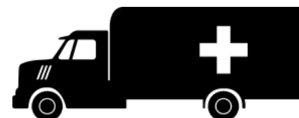
Ambulances with high electrical demands