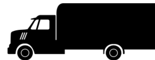
Small delivery trucks